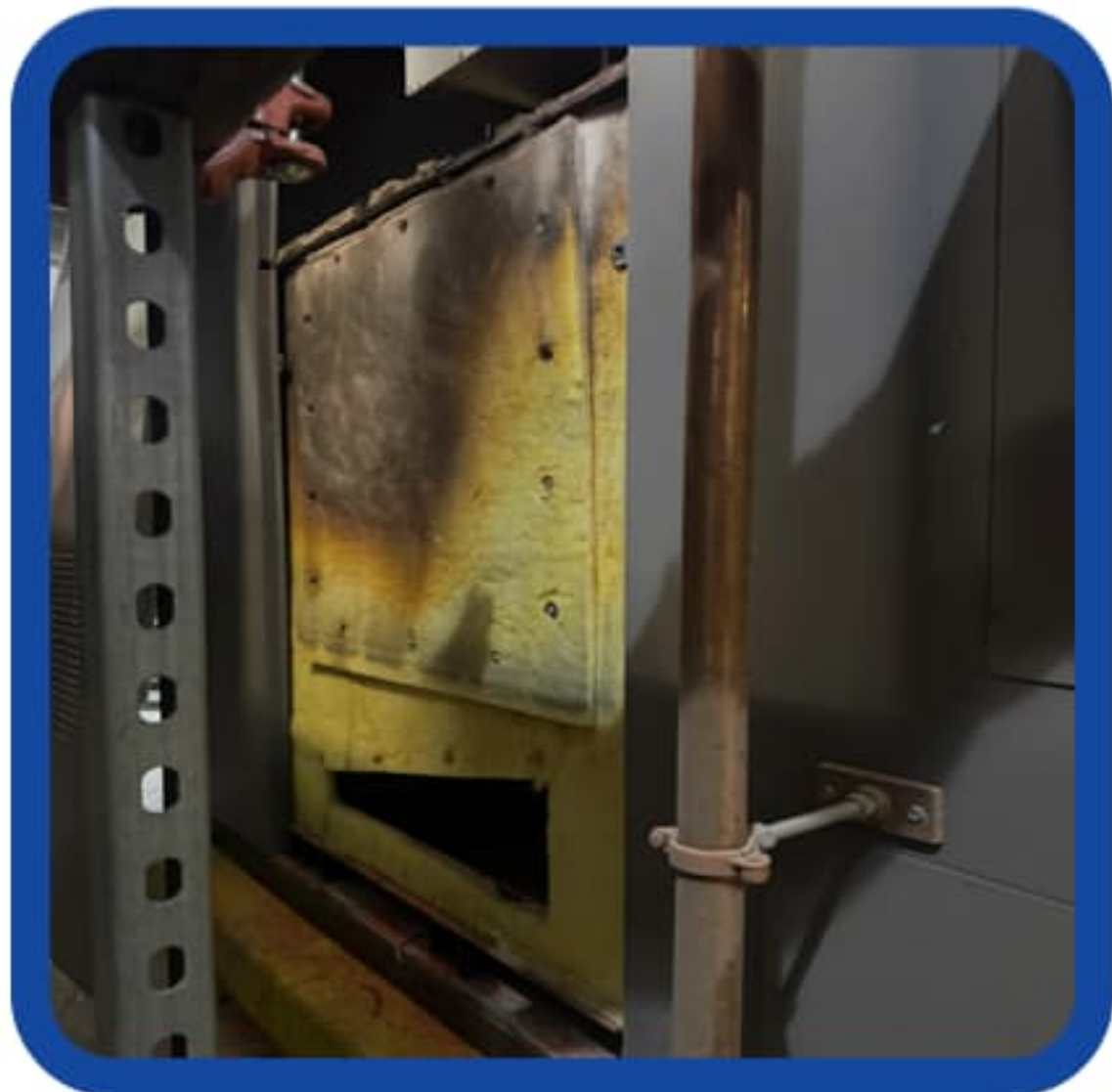
Fire Damaged Boiler