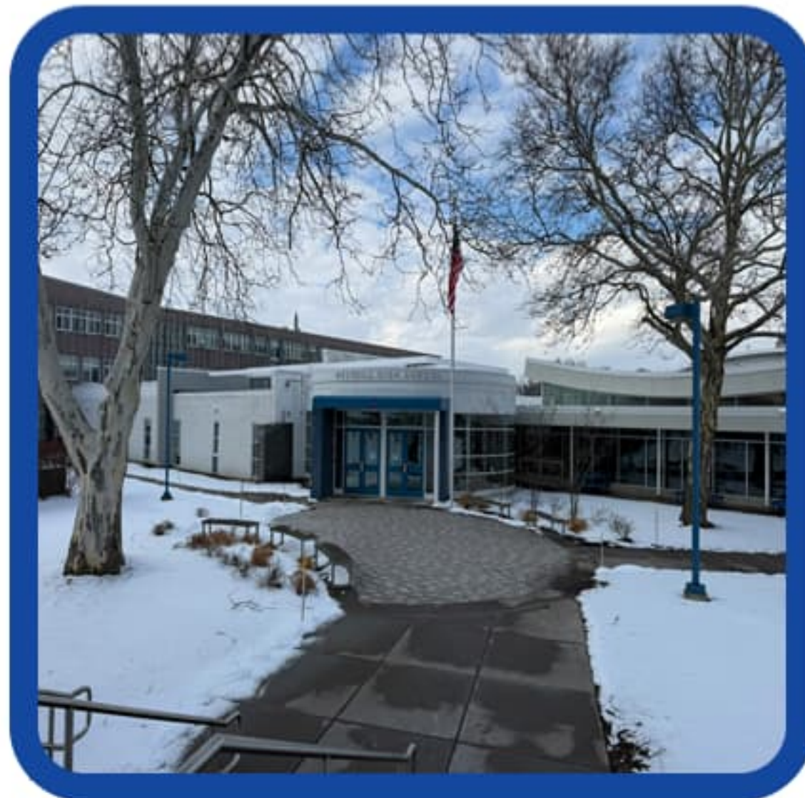
Upgrade Exterior Lighting at Entry & Front Parking Area (LED Efficiency & Safety)