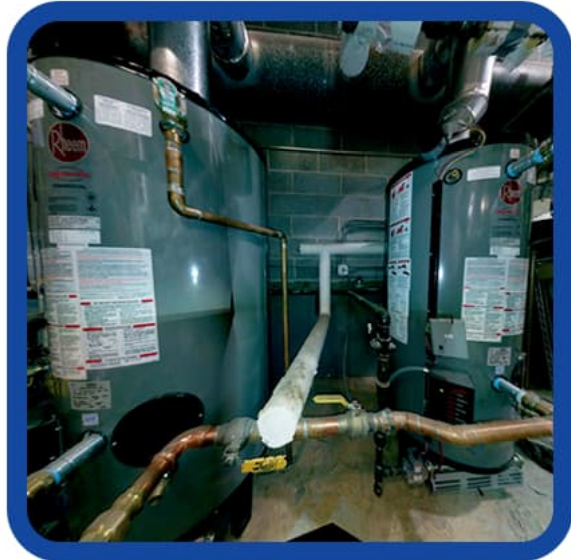
Mechanical Controls Upgrades