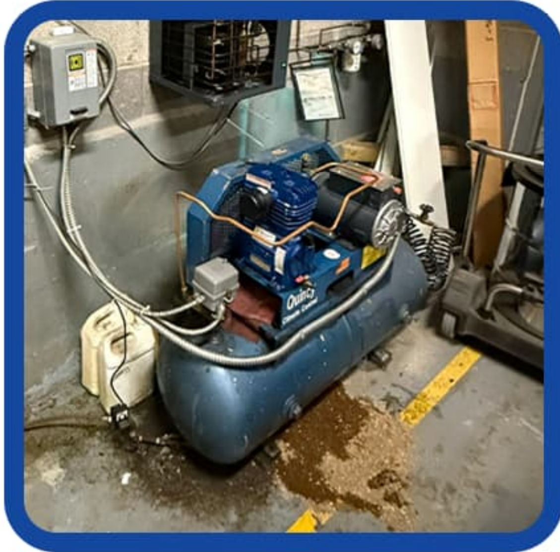
Mechanical Controls Upgrades