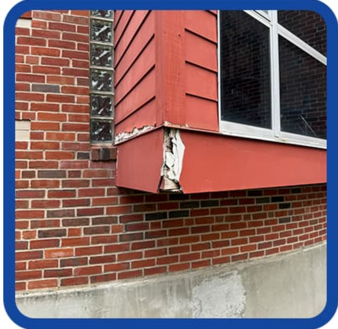
Building Facade Restoration (Siding Replacement)