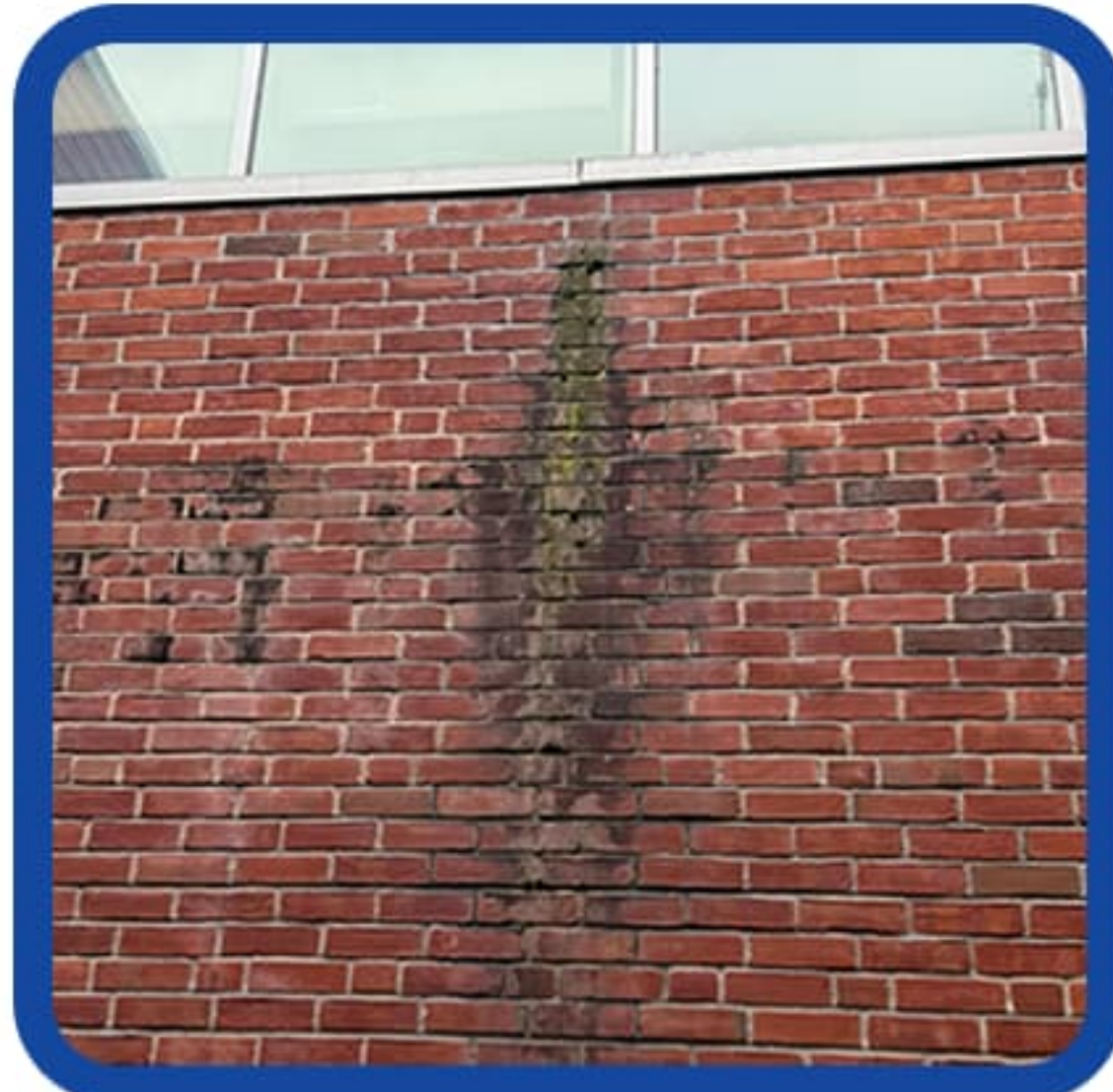
Brick Facade Restoration