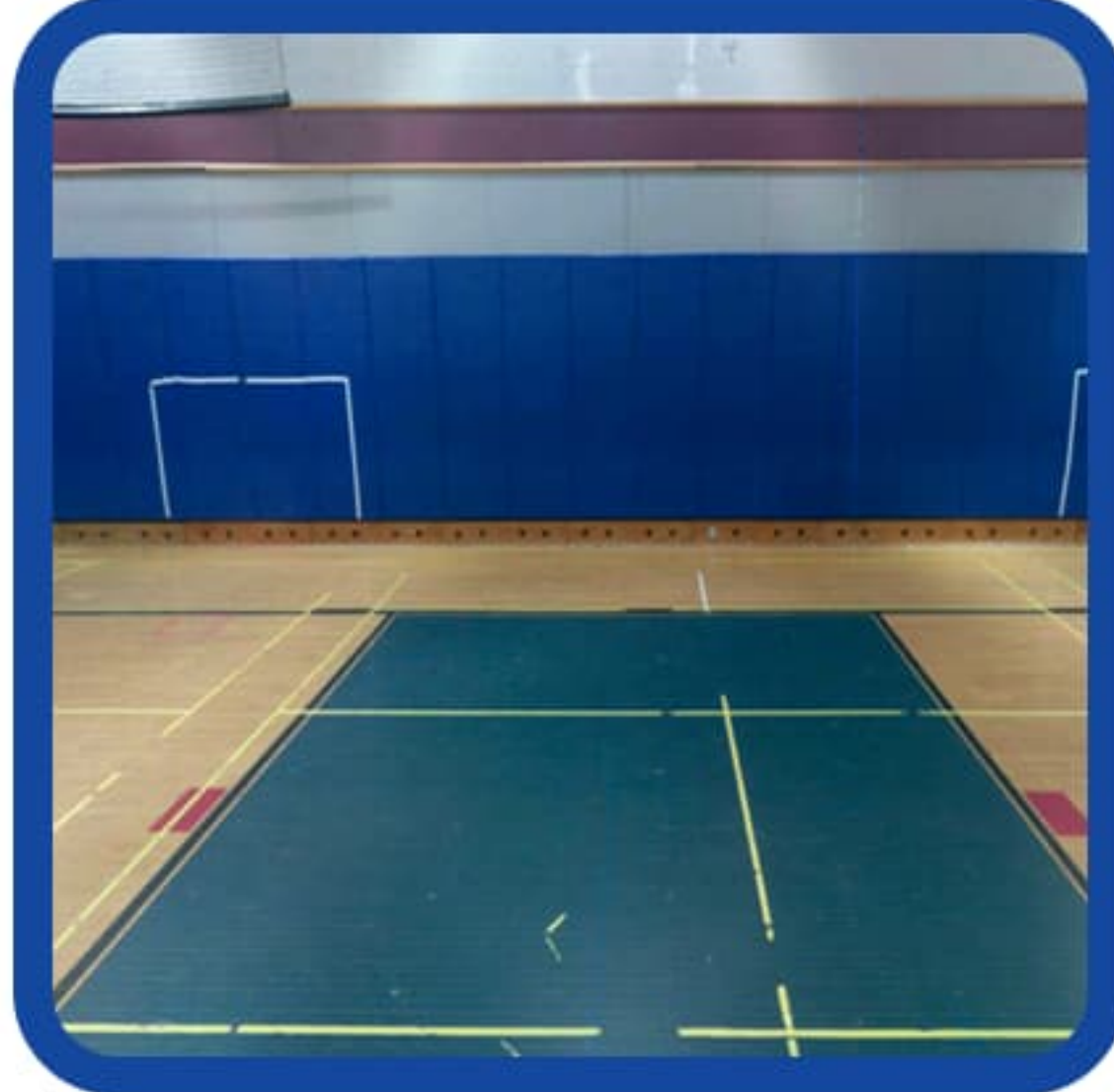
Gym Floor Replacement, New Bleachers & Gym Door Restoration (Safety Feature Added)