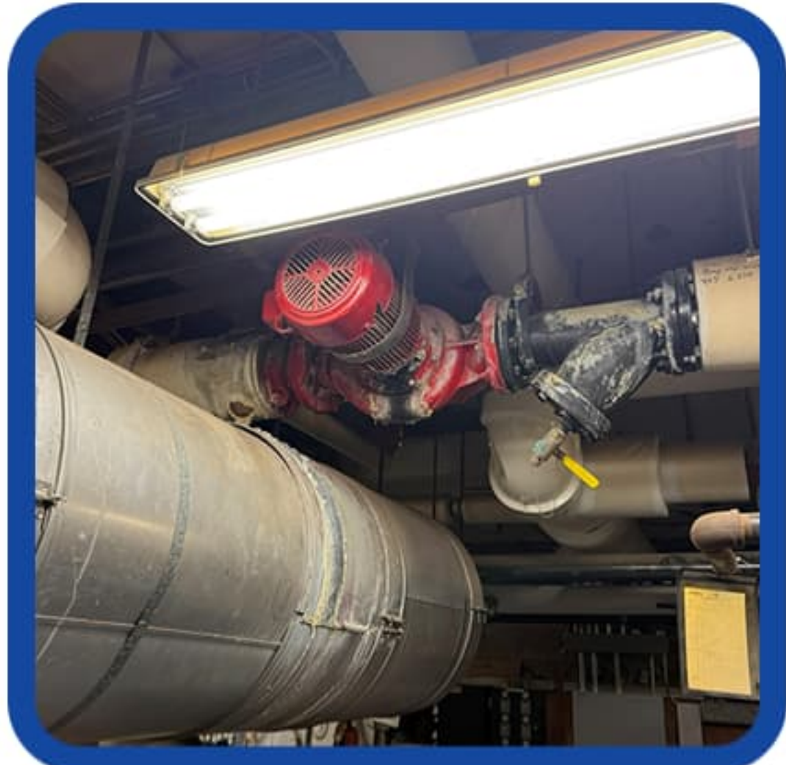
Mechanical Controls Upgrades