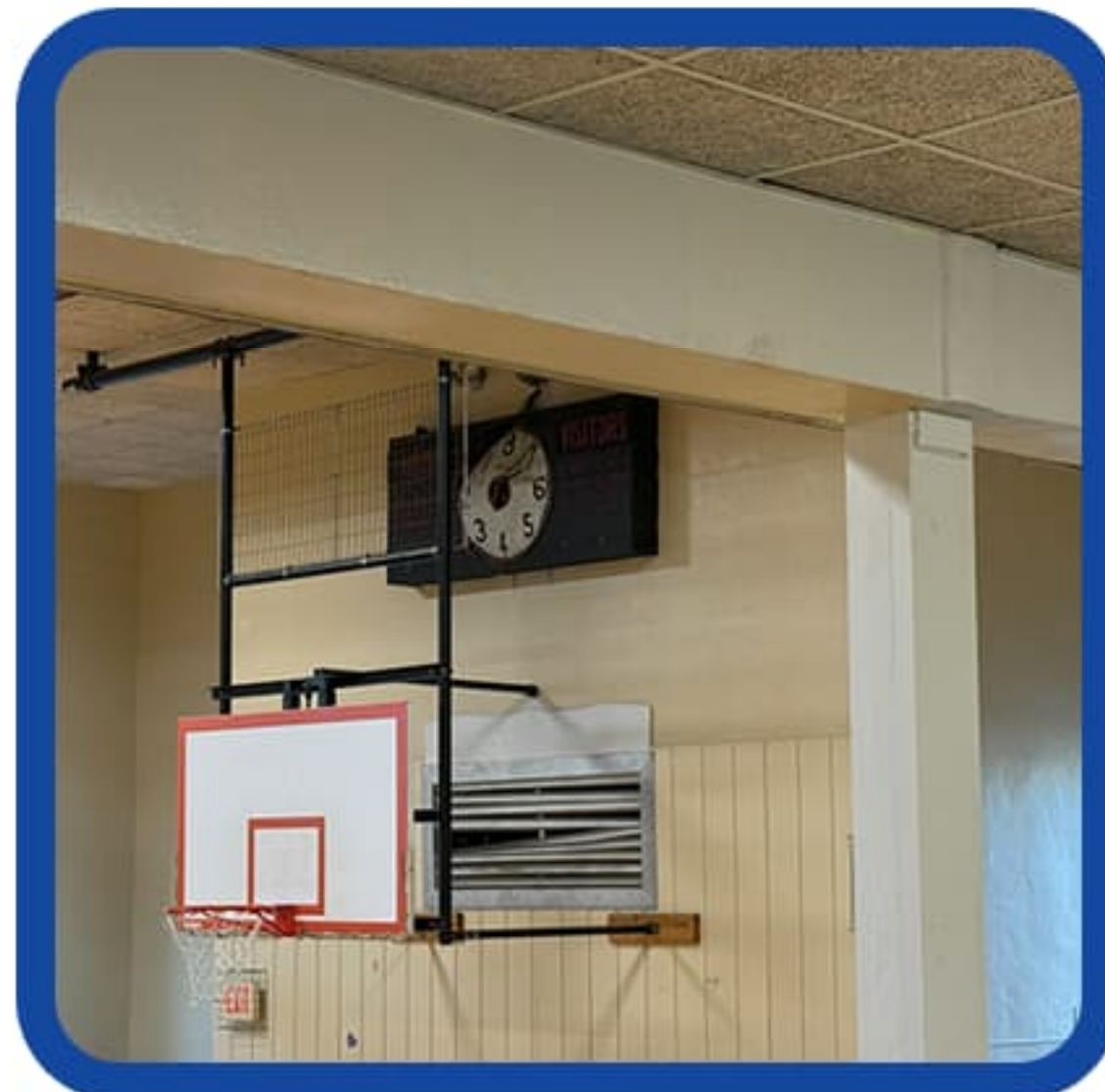
Mechanical Controls Upgrades