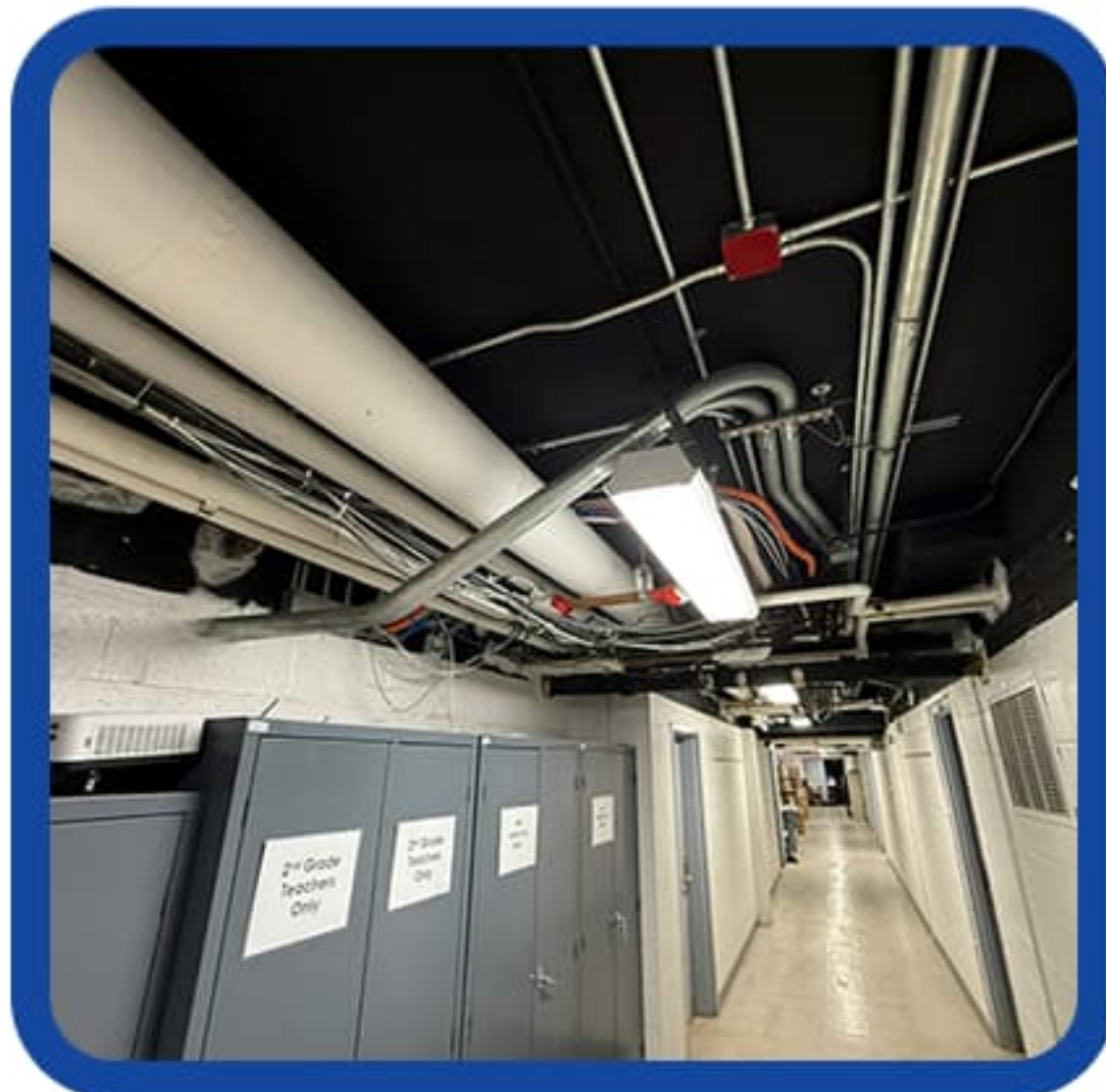
Ceiling & Lighting Upgrades