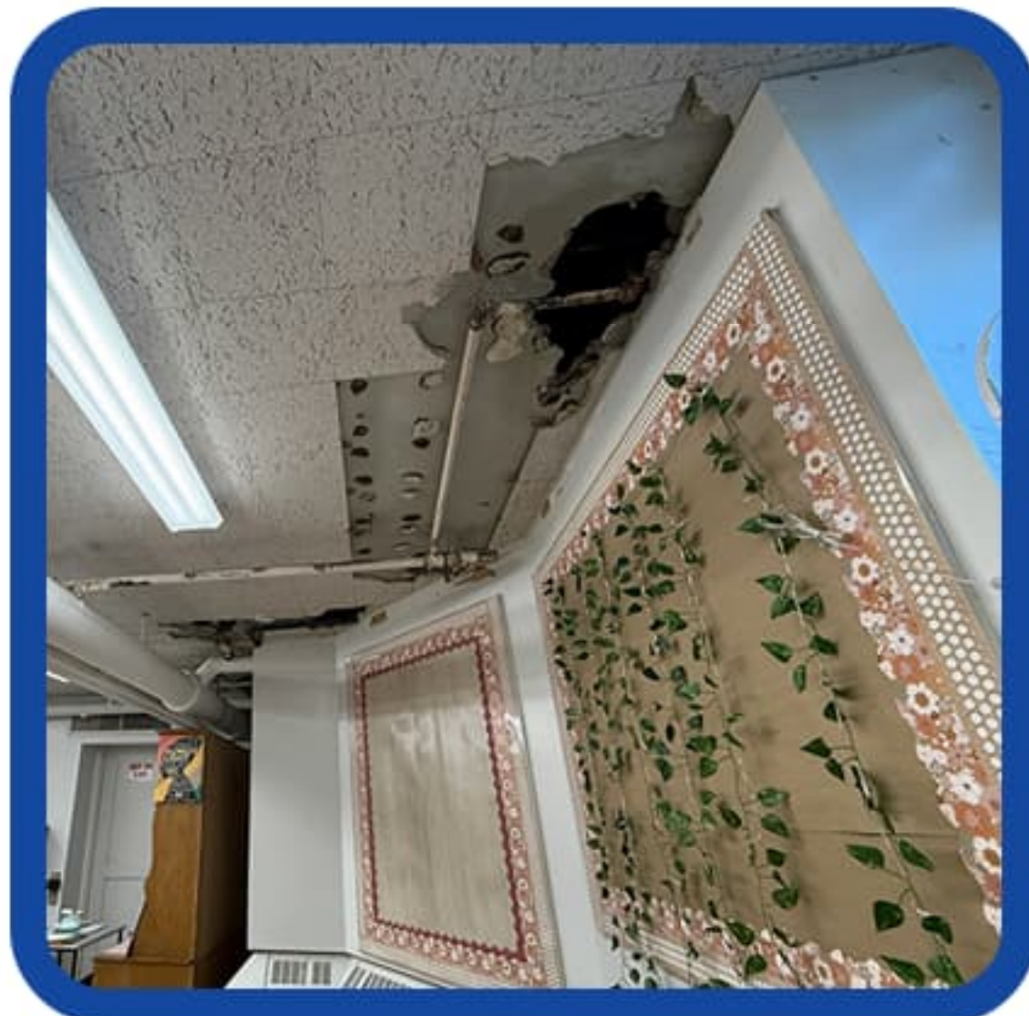
Ceiling & Lighting Upgrades