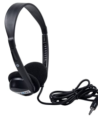
1 pair headphones over the head style *Labeled with child's name