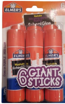
6 GIANT Elmer's glue sticks (0.77 oz size)