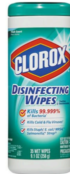
1 large canister of disinfecting wipes