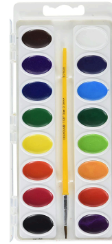
Watercolors (preferably Crayola) 8 or 16 colors