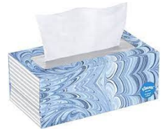
1 box of tissues