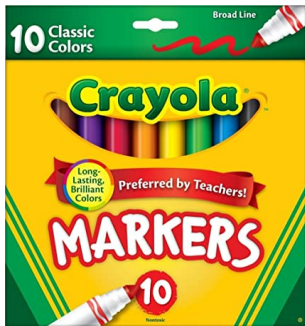
1 pack of markers