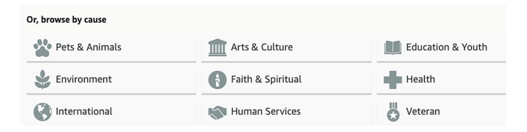
To support charity, always shop at smile.amazon.com

To use with a browser: Go to smile.amazon.com. If this is your first time on AmazonSmile you will be prompted to select a charitable organization to support. You can search for any of the Westhill groups listed above. If you already have an organization selected, you have the option to change at any time. Only purchases made through smile.amazon.com (instead of amazon.com) will count towards your selected organization so make sure to bookmark on your device!