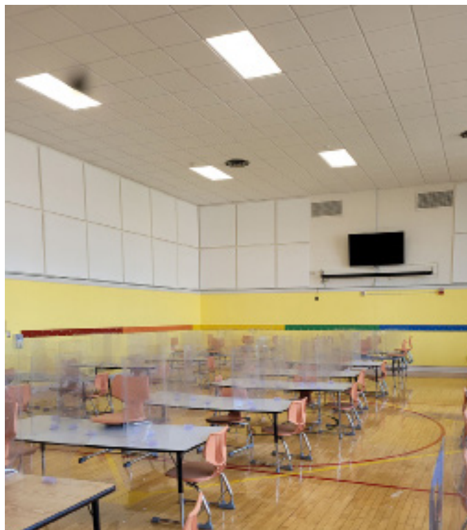
Walberta Park School Cafeteria