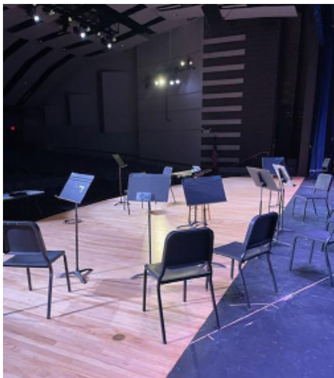
Westhill High School Stage

Bid documents are being prepared and the project is on track for SED approval in December 2021, with the project going out to bid in January 2022. Construction is scheduled to occur June 2022 – August 2023, closing out fall 2023.