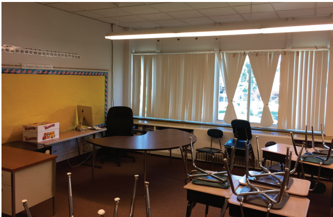
Cherry Road Elementary 2nd Floor Classroom - Proposed for Renovation