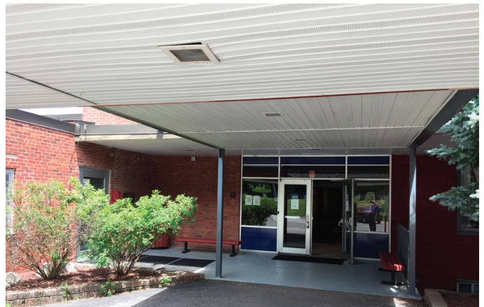
Onondaga Middle School - Proposed for Security Upgrades