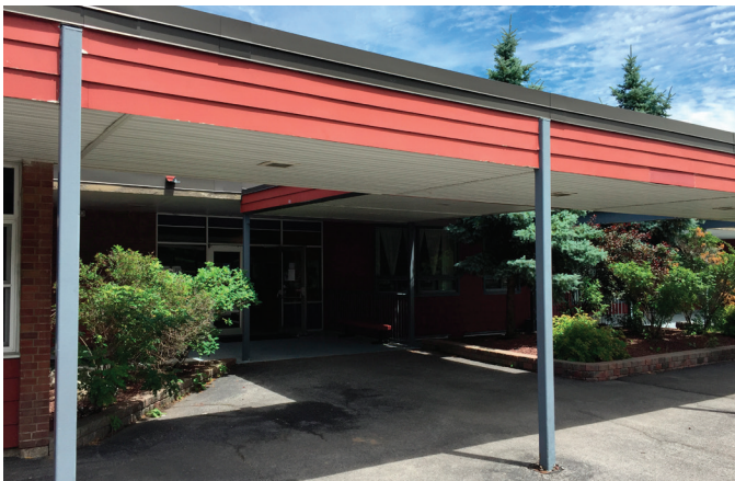
Onondaga Middle School - Proposed for Site Enhancements