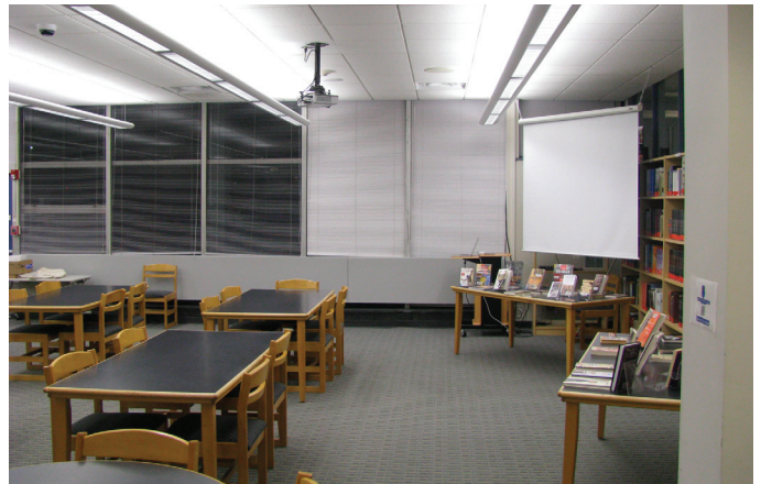
Current High School Library (Proposed for Renovation / Reconfiguration)